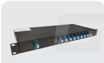
19" 1U Rackmount