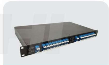
4slot 1U Rackmount